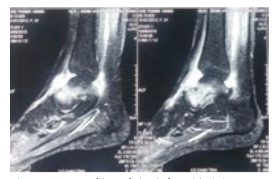
Figure 2: MRI film of the left ankle joint

surface corresponding to the suspected location on the CT film and the MRI film. After purifying the abnormal articular cartilage at the talar neck, the tumor is exposed with the nidus in the central region ( Figure 3 ).